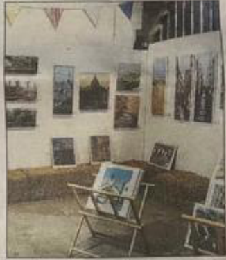
Art Weeks will take place this month