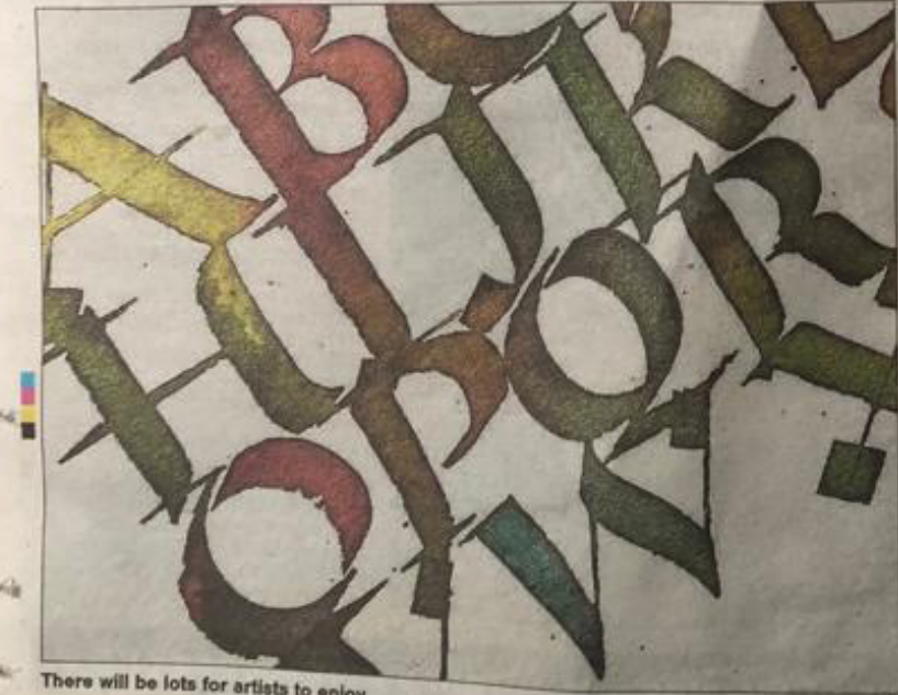
There will be lots for artists to enjoy