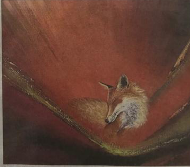
Some of the artwork