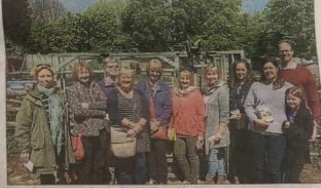
There are many artists in Buckinghamshire