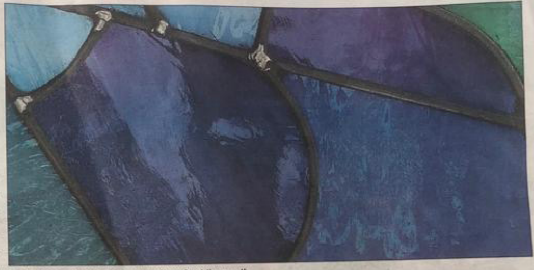
Many pieces of art will be on show throughout the month